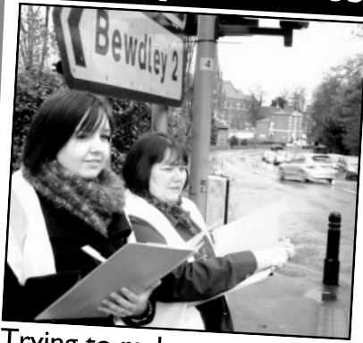
Trying to make sense of the Tories so called improvements which have caused chaos

Campaigning on issues that matter to us all